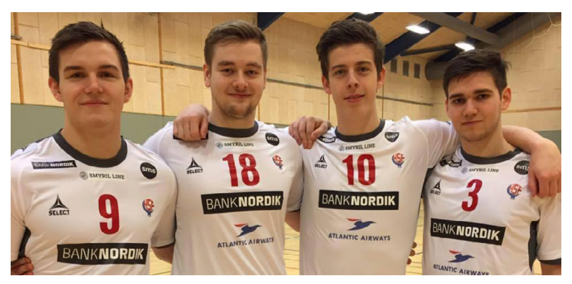
BankNordik is a proud sponsor of the U21 men's handball team, who in January 2017 qualified for the World Championships to be held in Algeria in July 2017. This is the first time a national team from the Faroe Islands has qualified for the World Championships endgame.