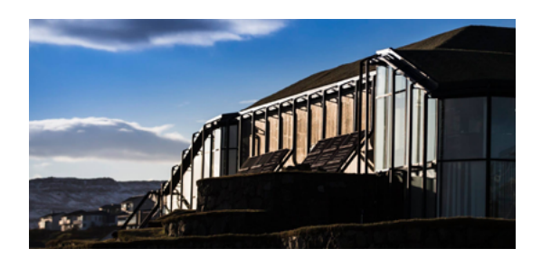
In January 2017, BankNordik entered into a partnership agreement with the Nordic House in the Faroe Islands. The partnership seeks to promote Nordic culture and art.